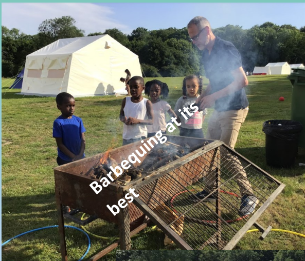
Barbequing at its best