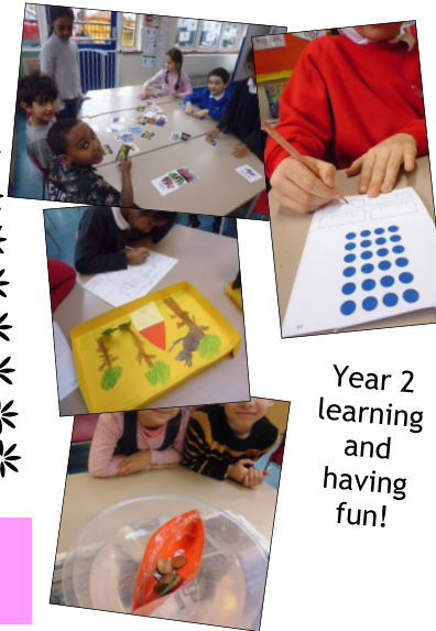
Year 2 learning and having fun!

When sharing books with your child at home, encourage them to make their reading sound more exciting. Help them to change their voice to show scary, sad or dramatic parts of the story, altering their voice for different characters and speaking loudly when words are written in bold or large letters.