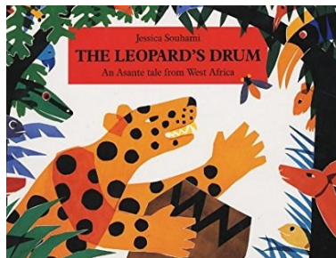
Our main books for this half term.