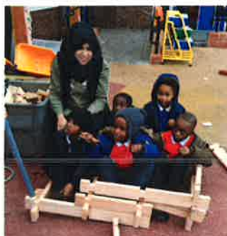
The children are off on a journey.