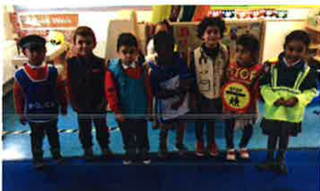
People Who Help Us

The weather is changing and it is getting cold and wet, a change of clothes is always a good idea. Please ensure that your child is dressed appropriately with good shoes, warm coats, hats, scarves and gloves. Can you ensure that their names are in them as many children wear identical clothes. It would be very helpful if you encouraged your children to put on and take off their own coats.