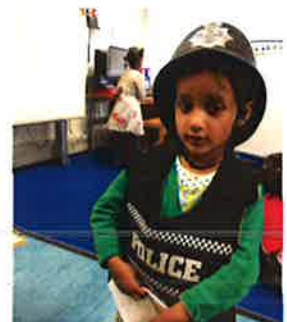
The children role-played being Police Officers.